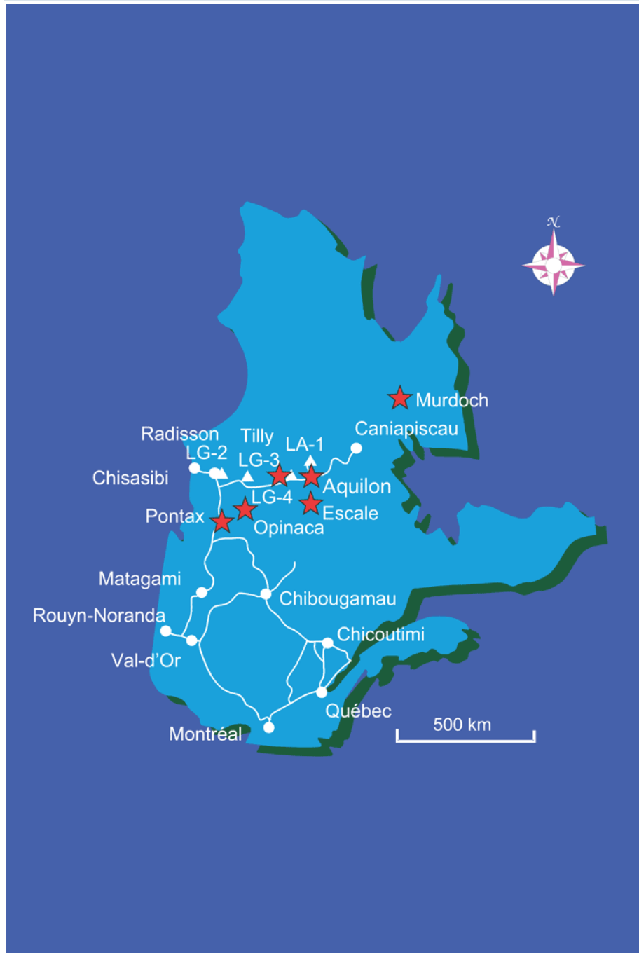
Figure 1. Sirios Quebec Properties