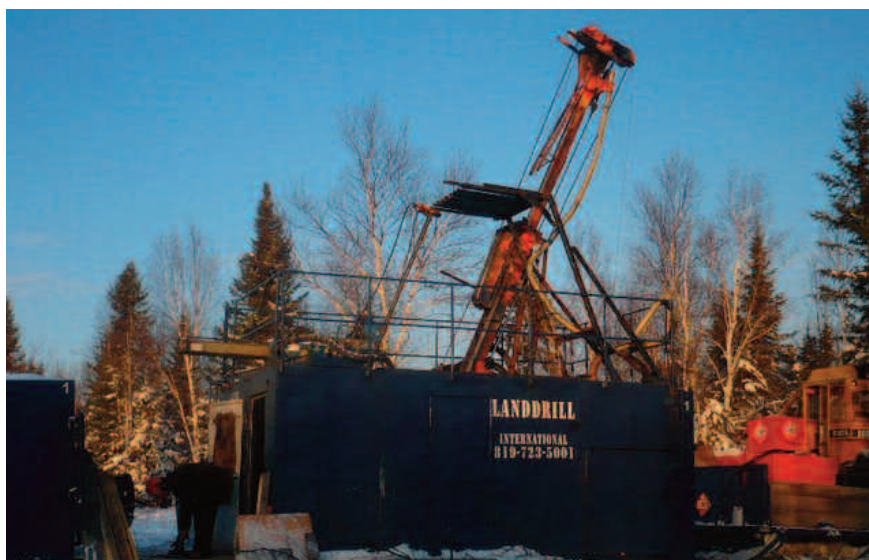
Drilling and Lots of “Blue Sky” at Granada!

“We’re looking forward to additional results and a large new phase of drilling with great anticipation and excitement,” Basa continues. “Combined with the positive results we got from a large bulk sample, we’re very confident we’ll succeed in our objective of defining an economic, bulk tonnage deposit at Granada that is amenable to open-pit mining. We have a focused, dedicated team that is determined to advance this increasingly promising project and build shareholder wealth in the process.”